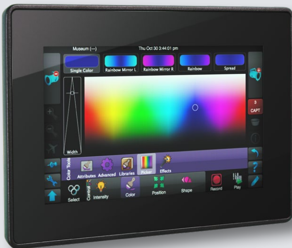
Choreo Wall-Mount 7" Touch Screen PWCHOREO WM