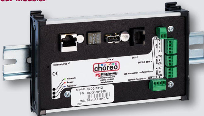
Choreo DIN-mount PWCHOREO DIN