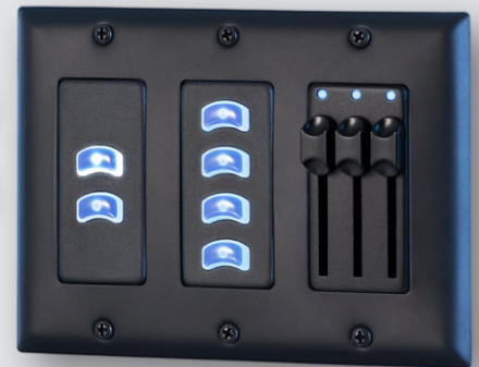
NSB Wall Station

Each is priced to suit the artistic needs of: